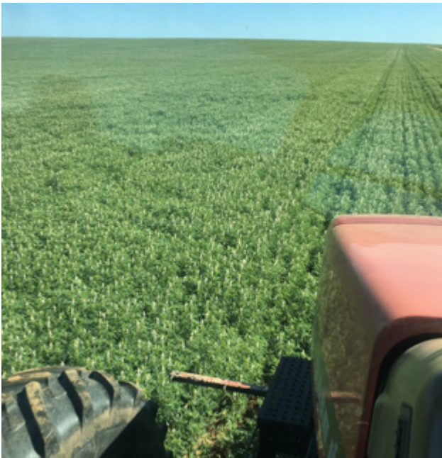
CTF tramlines in a lupin crop on the Rayner family's Carnamah property.

To test the extent of compaction caused by uncontrolled machinery traffic following deep ripping, Avon set up his own trials on the farm.