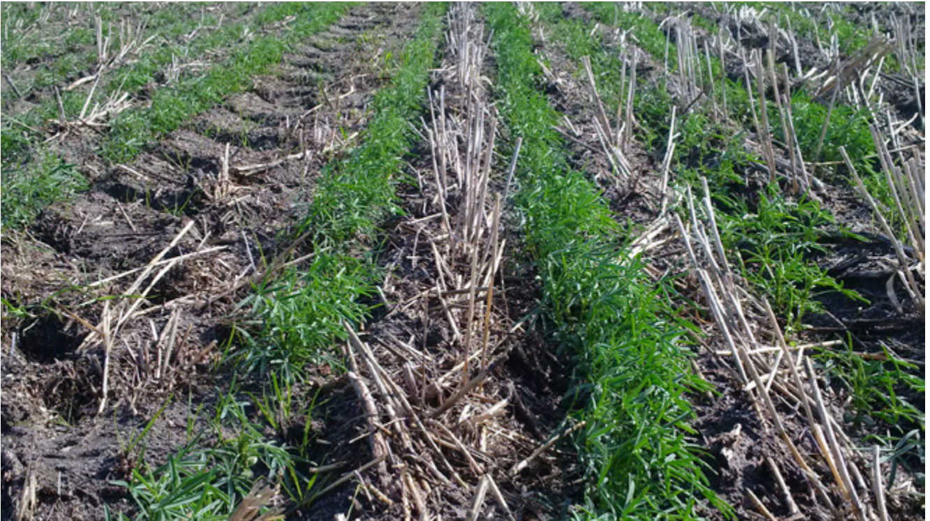
Inter-row sown lupins with a 'chaffy' tramline on the left side of the photo at the Ball family property.

The John Deere 9870 STS harvester was acquired as part of a regular upgrade of farm machinery and is fitted with chaff decks to funnel weed seeds onto the tramlines. A PowerCast™ Tailboard chopper and spreader is mounted at the rear of the chopper.