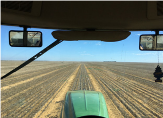
The Ford family has taken a gradual, low-cost approach to machinery changeover to implement a nine metre CTF system on their property.

On-farm trials conducted with GRDC investment by the Department of Agriculture and Food Western Australia (DAFWA) on the Ford's property have shown the long-term benefits of deep ripping in alleviating soil compaction.