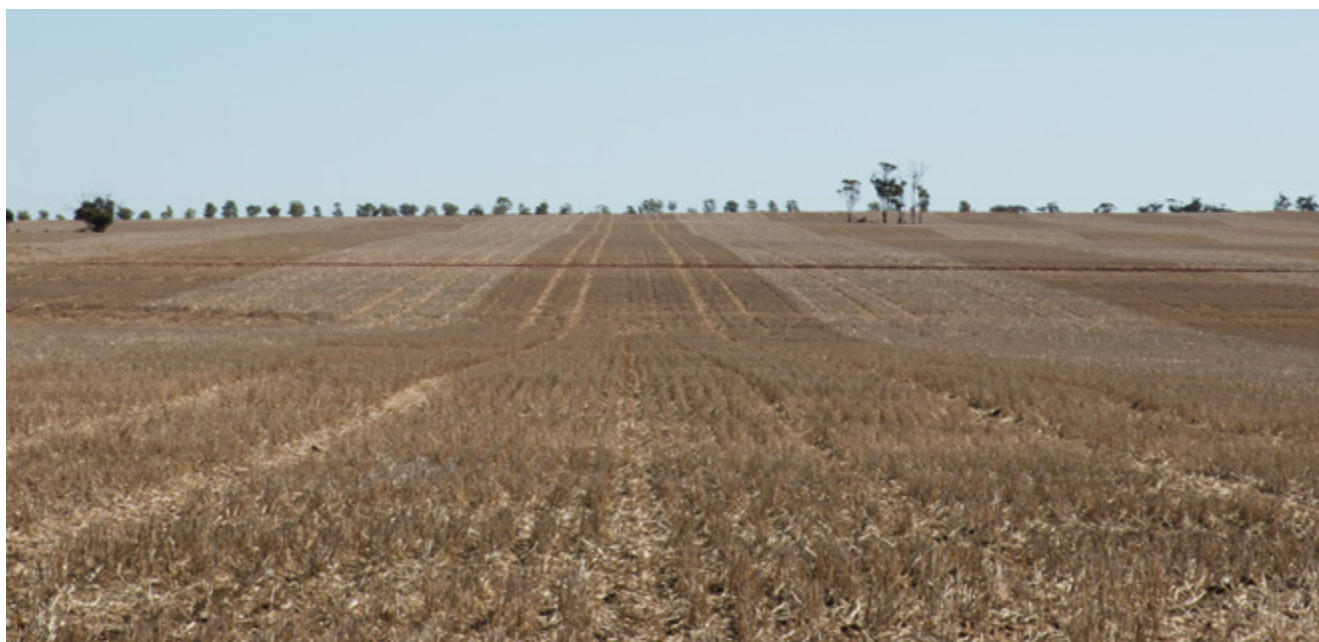
Controlled Traffic Farming is being used by many Western Australian growers to reduce cropping risks on highly variable soil types.

Research and experience is showing clear long-term advantages of adopting CTF when using subsoil constraint amelioration strategies, such as deep ripping, spading, delving and/or soil inversion.