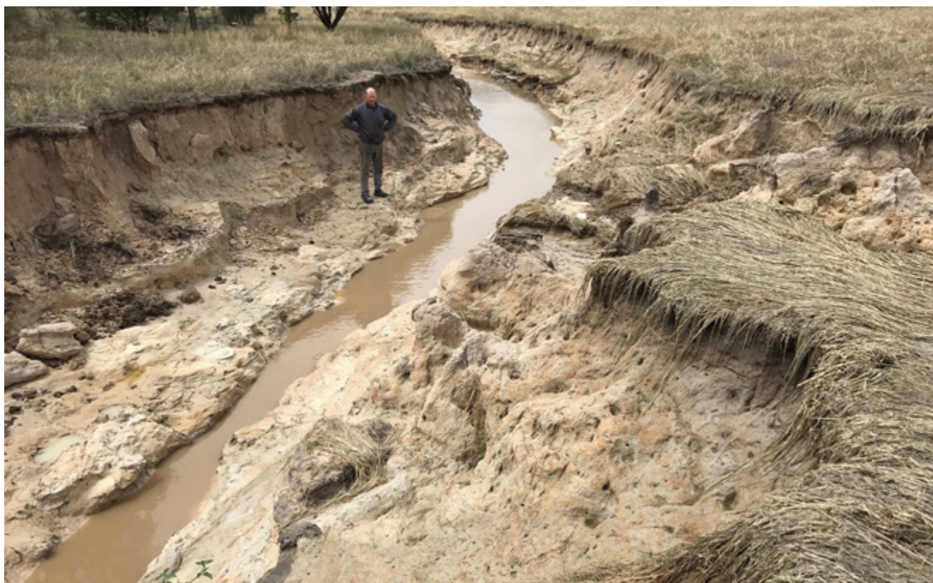
Lloyd Burrell standing in the severely eroded edge of a paddock in February 2017.

Lloyd says some of the drawbacks include increased pressure on tyres, causing more frequent blow-outs.