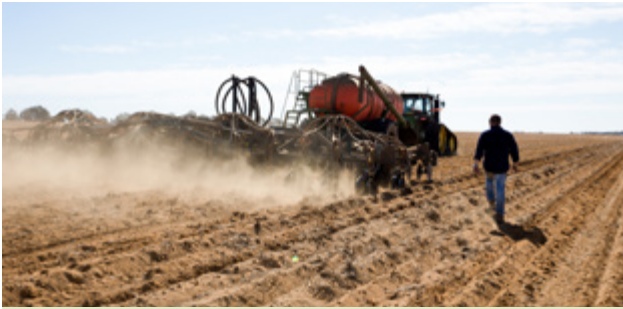
Jono Lampp, of Lawson Grains, says they are seeing an up to 6 per cent reduction in input overlaps compared with non-CTF areas in their operation.

The ability of the Cross Slot® to seed in heavy stubble means the operators can afford to lift the cutting heights on the headers. Jono says there could even be options to move to a stripper front on the cereals, which would improve harvest efficiency.