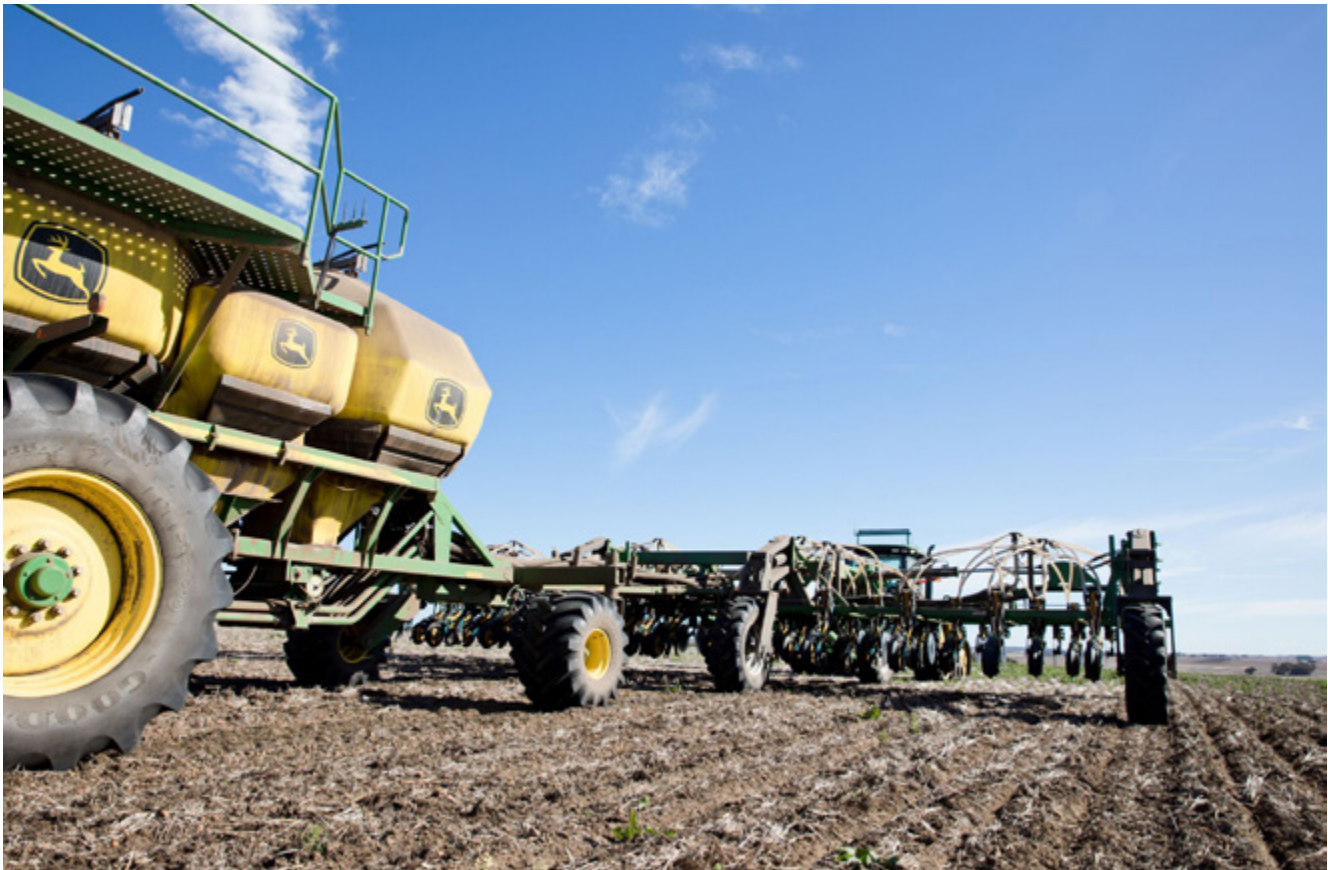
The Syme family had a seeder built to suit their CTF system.

“Because the tramlines are the most unproductive part of the paddock, the weeds just don’t grow as well either – and we get minimal dust when tracking because the weeds are there.”