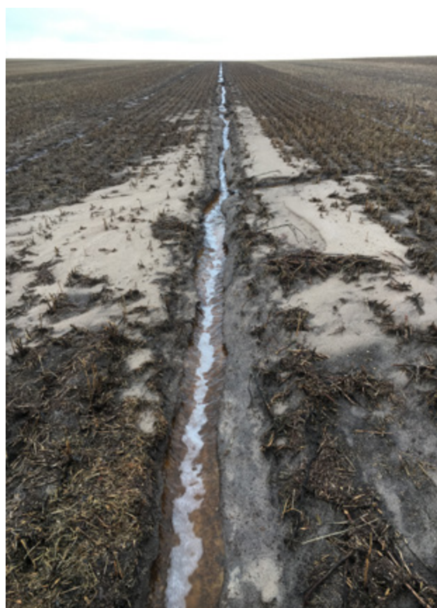
Tramline erosion after flooding rain in February, 2017.

“We have renovated some of the damaged tramlines with a grader and a loader and we’re hoping that over time, some minor ones will be filled as the neighbouring tyne throws soil back into the rut.