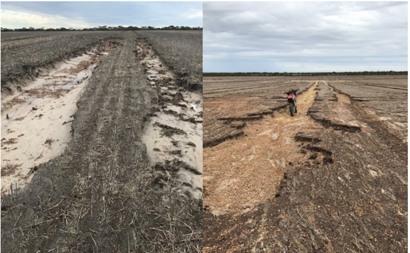
Tramline erosion on the Burrell's property in Mt Madden following heavy rainfall in February 2017.

“CTF made sense to me when I adopted the system and it still makes sense to me now – as far as having the whole system of machinery matching in operational widths.