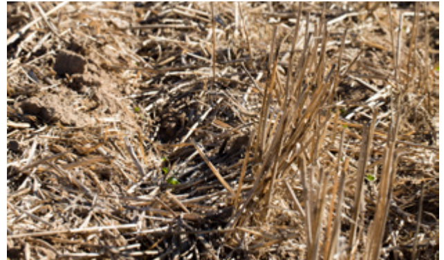
An increase in the soil water 'bucket size' has been achieved by eliminating the physical and chemical barrier, which means crop roots can chase the moisture and nutrients down the profile when there is a dry spell.

Lawson Grains uses John Deere GreenStar™ 2630 displays and StarFire™ receivers for the Real Time Kinematic (RTK) autosteer system.