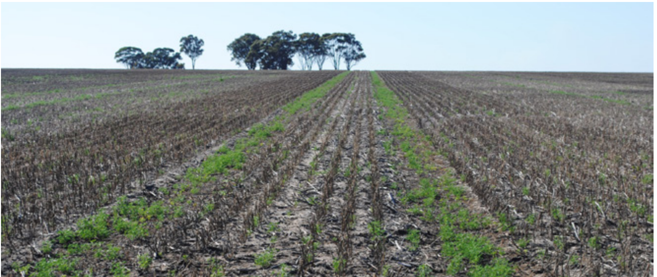
Lupin and weed regrowth on tramlines in a lupin stubble paddock. The lupin crop was harvested with a New Holland 9.90 harvester on 3m wheel tack centres and chaff decks were used to direct chaff onto tramlines. The idea is to control and restrict weed and crop regrowth to one area to minimise weed competition in the following crop. The weed seeds and volunteer regrowth on the tramlines can be selectively targeted with herbicides.