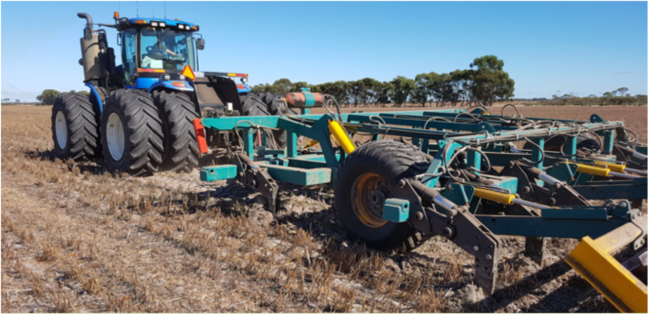
The Fowler family's deep ripper in action.

“We have tracks on four out of the seven combines that we use and they come with extended augers so that we can unload on the tramlines.